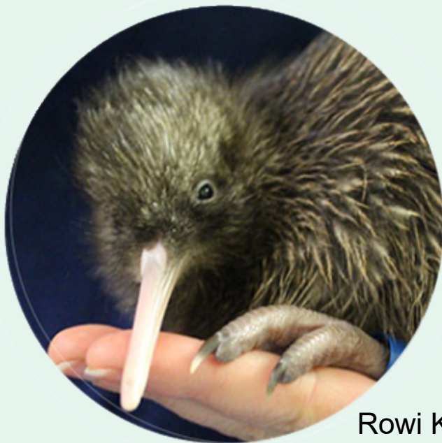
Rowi Kiwi, Franz Josef